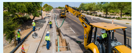
Beardsley WRF Solids Pipeline Rehab, City of Peoria