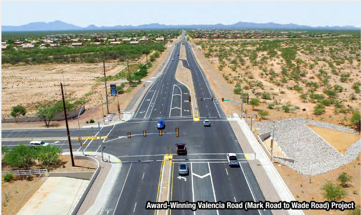
Award-Winning Valencia Road (Mark Road to Wade Road) Project

550 S. 79th Street, Chandler, AZ 85226 | 2425 W. Wave Hill Court, Tucson, AZ 85705